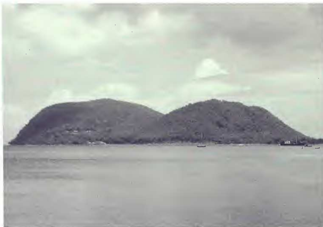
Figure 4.—Cabrits Peninsula, St. John Parish, on the northwestern coast of Dominica.

Most bats of this species netted in 1966 were captured between darkness and 2200, but several were taken after midnight. Four quiescent bats, of which three were female, had rectal temperatures averaging 35.9^{\circ}\text{C} ( 32.6^{\circ}\text{C} to 37.4^{\circ}\text{C} ). A single active female had a rectal temperature of 37.8^{\circ}\text{C} . Five males weighed an average of 16.9 (15.1-18.5); two non-pregnant females weighed 18.3 and 18.7 (lactating), whereas four pregnant females averaged 22.8 (17.8-25.2).